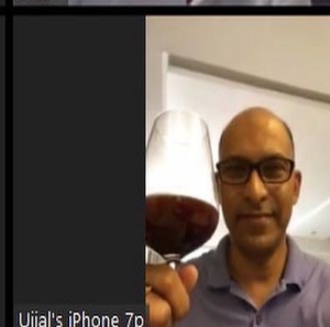
Ujjal's iPhone 7p