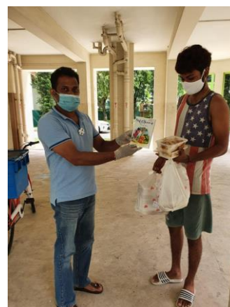
Food and Books of Humour were distributed to the Sri Lankan students