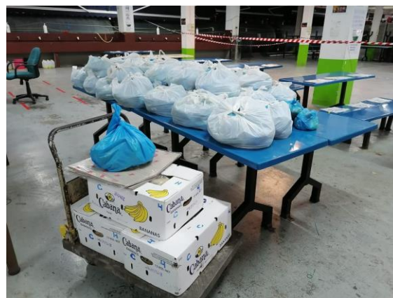
Project to provide food for migrant workers for 15 days