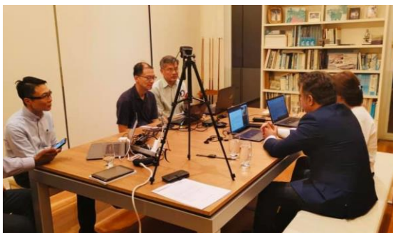
Webinar in session