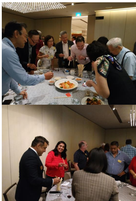
Tucking into the sumptuous “Yu Sheng”