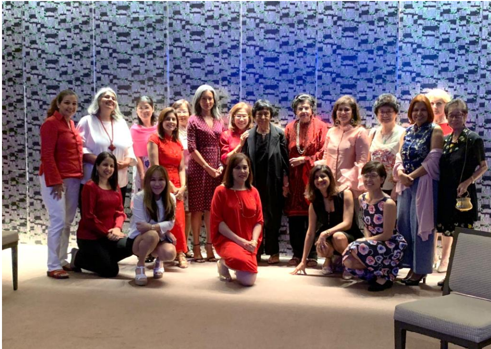
The Spouse Programme during the Club Assembly was well attended