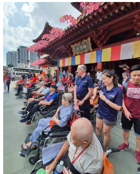
Assembling at Chinatown