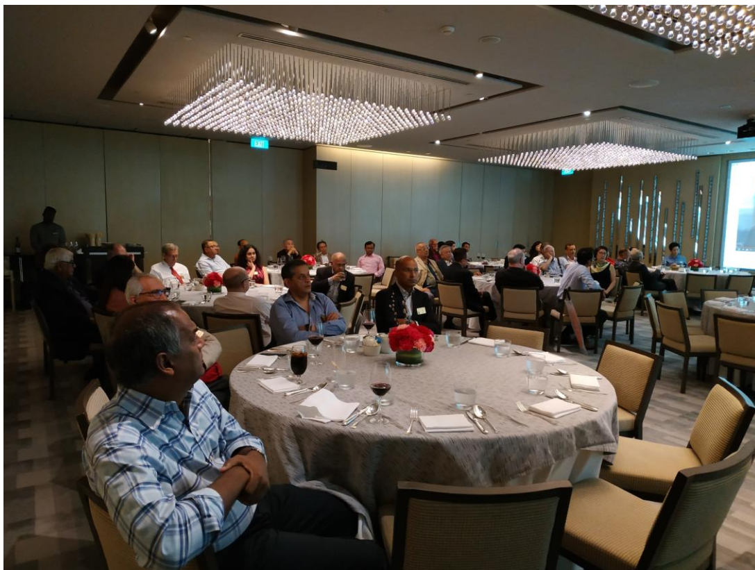
3 rd Club Assembly for RY 2019-2020 in session