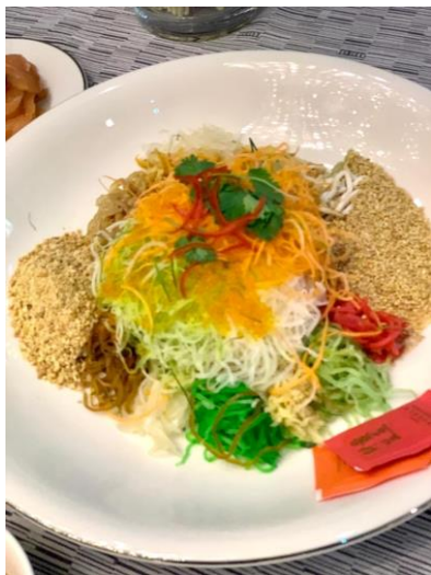
“Yu Sheng” dish

Following the Club Assembly, members and guests were invited to celebrate the Lunar New Year with Yu Sheng for the traditional “Lo Hei”!