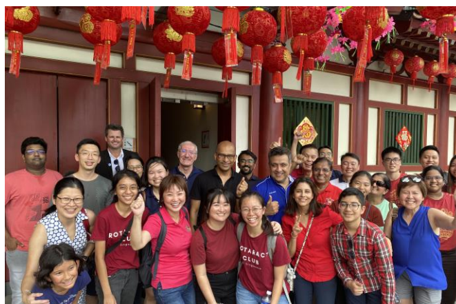
Happy participants of the CSC Project