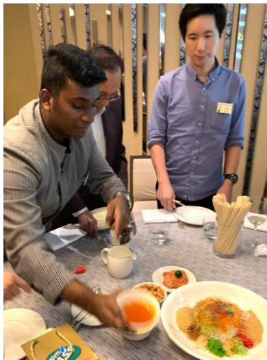
Preparing the Yu Sheng