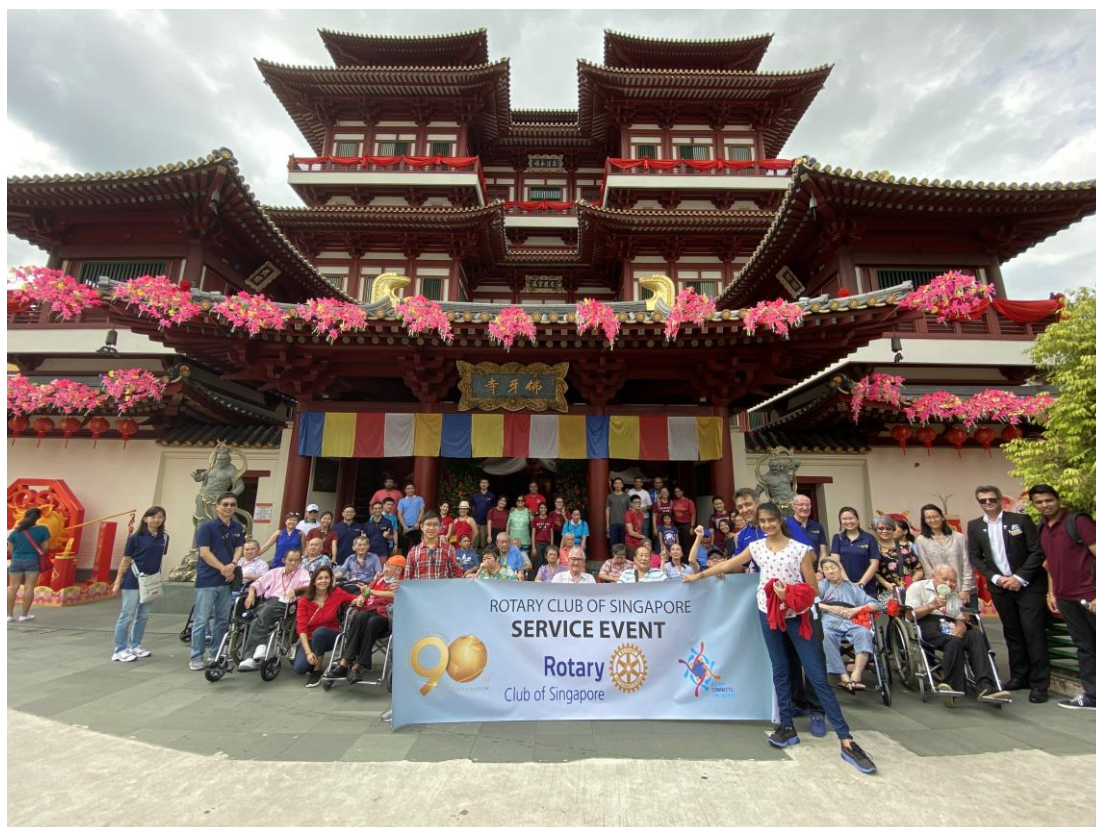
A group shot of one of the many Club service projects

All volunteers and residents enjoyed themselves thoroughly and we look forward to doing this again next year.