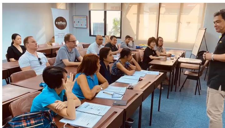
Class in session at SHATEC