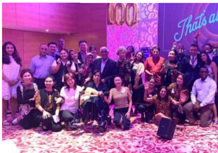
Fantastic support from everyone!