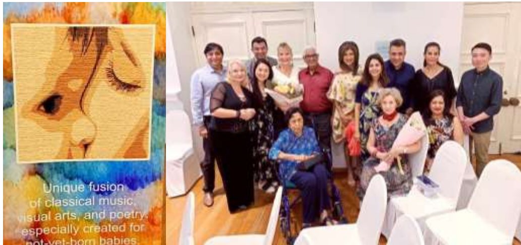
Members & guests who attended the Symphony of Motherhood concert held at the Arts House