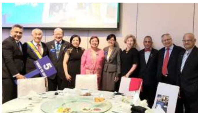
Members who attending the Dinner with District officials & guests