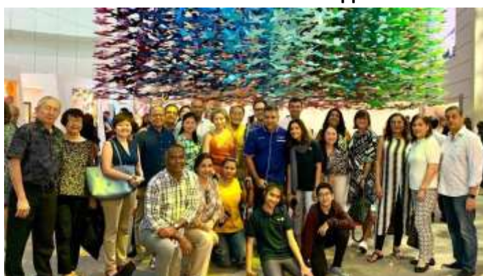
The Club's delegation at the Exhibition