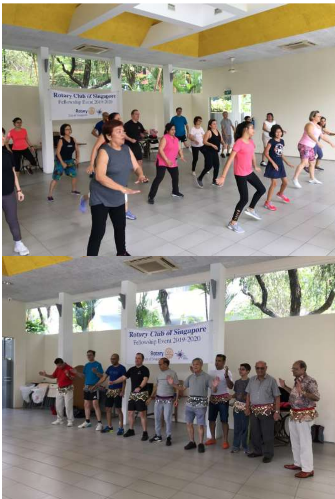
The Club's Zumba participants...