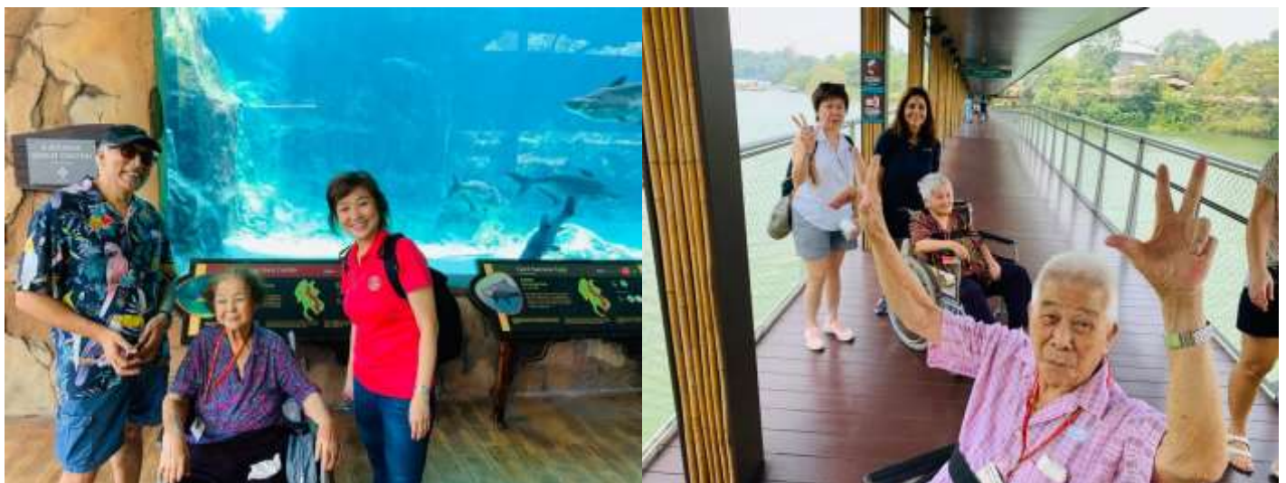
Smiles all around!