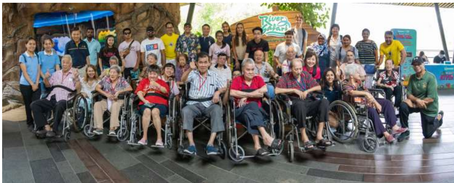
Thumbs up for an enjoyable tour

Accompanied by four staff from the SAS, the day started with lunch at Ah Meng's Kitchen. The haze miraculously cleared in time for the tour. It was a fun day for both beneficiaries and volunteers.