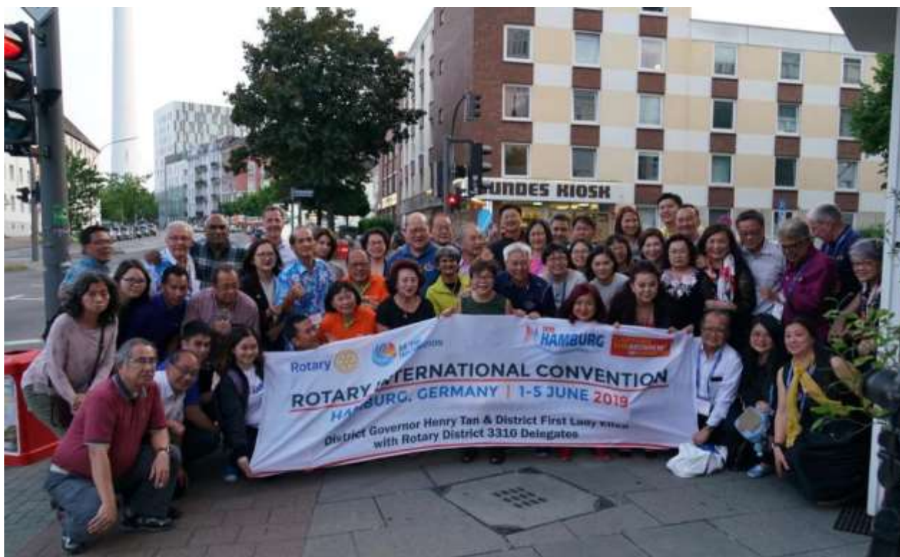
PHOTO ALBUM OF THE ROTARY INTERNATIONAL (R I) CONVENTION IN HAMBURG, GERMANY...