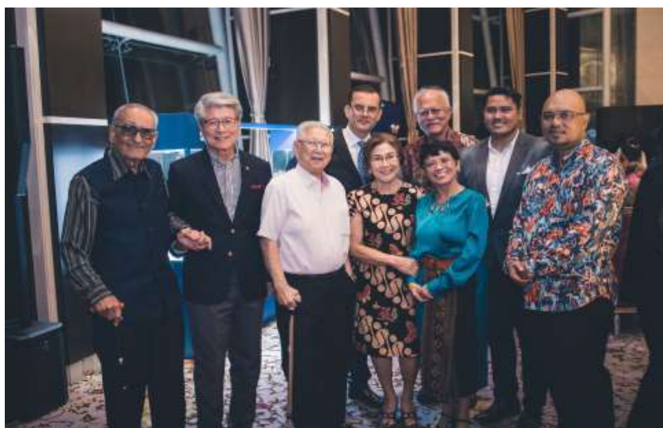
Our members with the 3 Artisan Award finalists