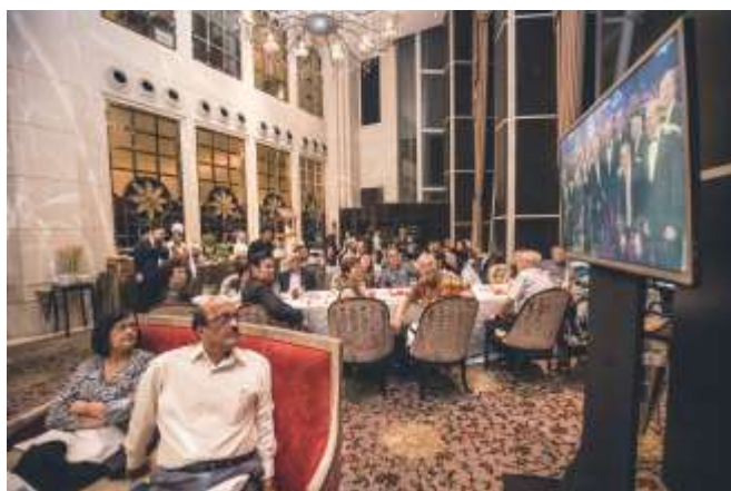
Watching the Vocational Service presentation