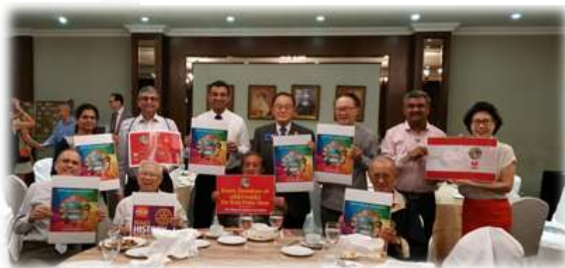
Members and visiting Rotarians holding up the Rotary World's Greatest Meal to Help End Polio posters