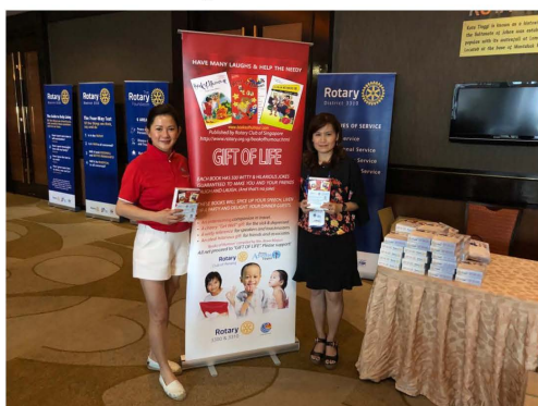
“Gift of Life” volunteers in action