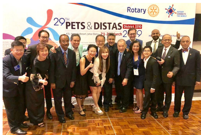
The Club's delegation at PETS & DISTAS