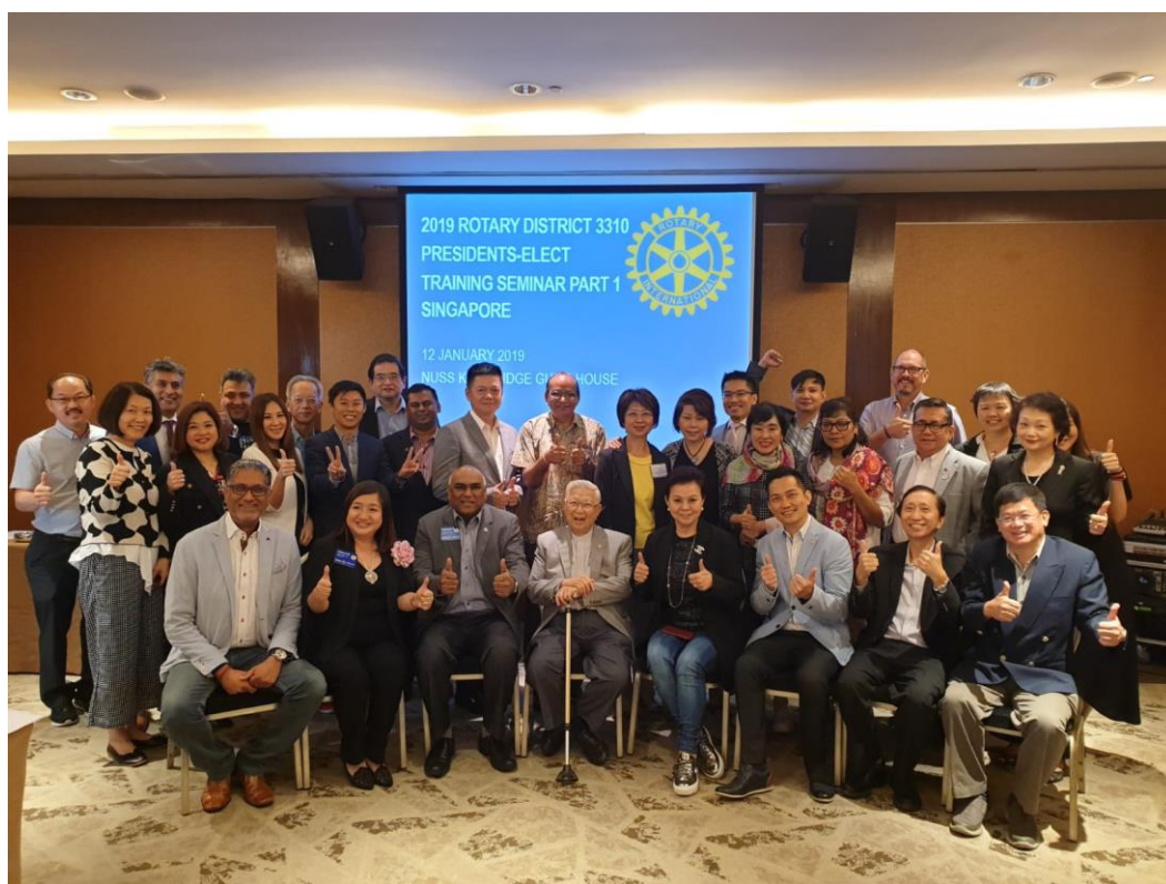
Group Photo of incoming Presidents (RY 2019-2020) with District Officers