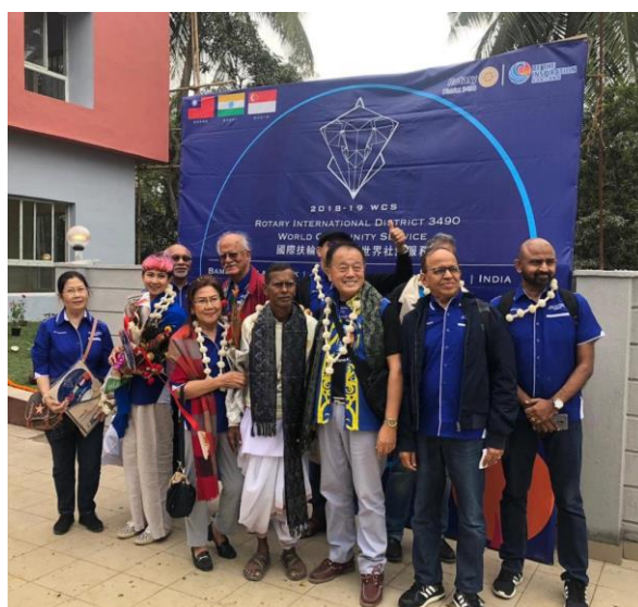
Delegation visits the Rotary Vivekananda School & Skill Development Centre