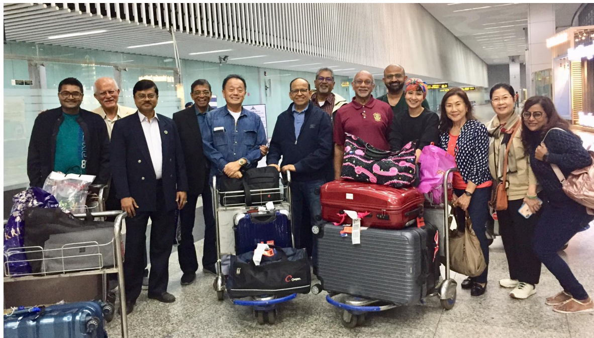
Club's delegation upon arrival in Kolkata – team of 18 from RC Singapore joined 84 Rotarians from Taiwan District 3490

Following is a montage of photographs taken at the recent India Mission which took place from 14 to 18 December 2018. A report on the Mission will be featured in the coming Club's bulletins.