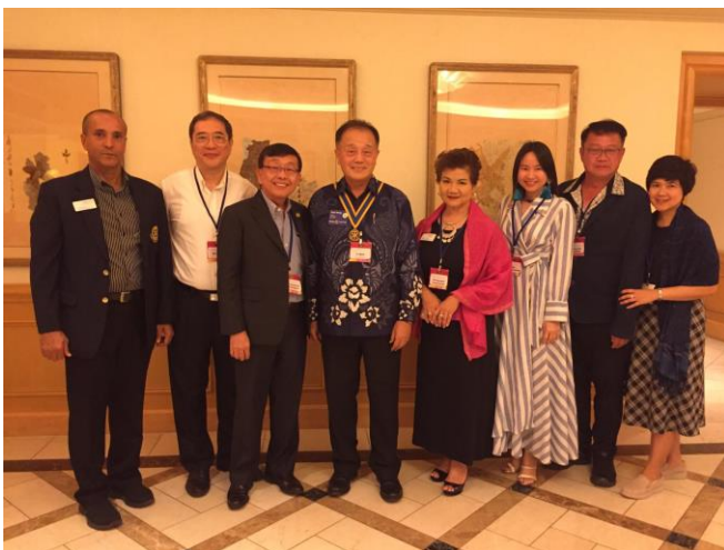
Meeting with Rotarians from Rotary Club of Bangkok (left) and Sister Club, Rotary Club of Taichung Tatong