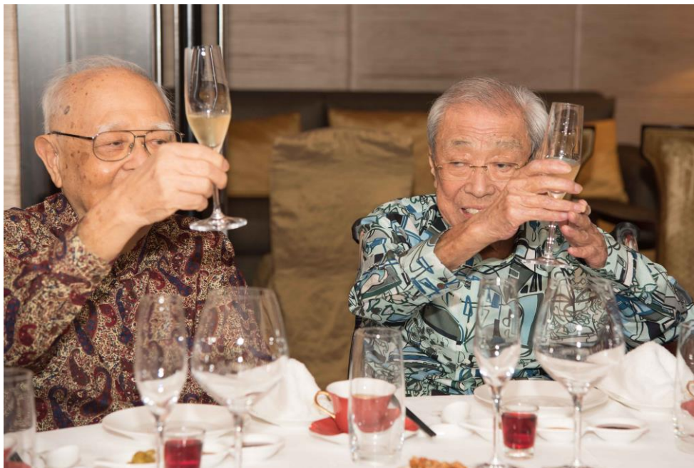
Cheers to your good health!