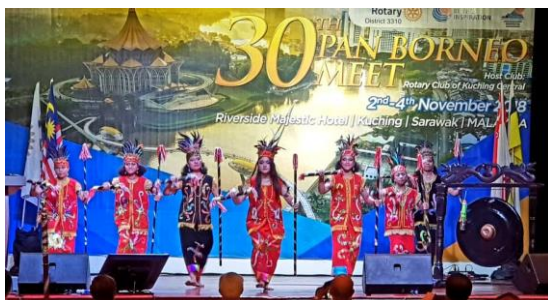
Performance by the Yayasan Prima Unggul (YPU) dancers