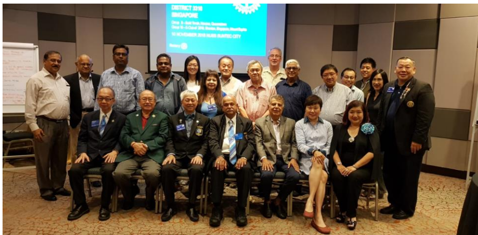
A group photo of the participants at the Seminar