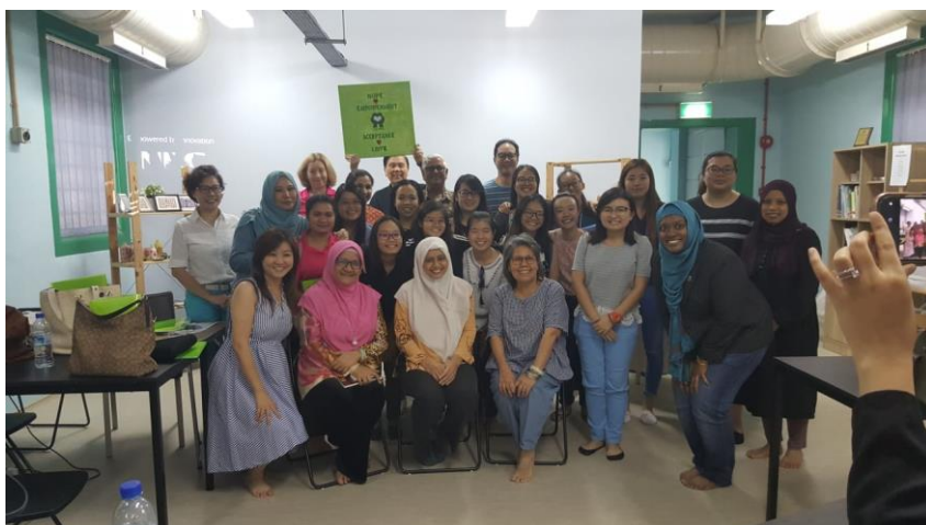
Members and friends at the Mental Health Training Session conducted by Club HEAL on 15.9.18