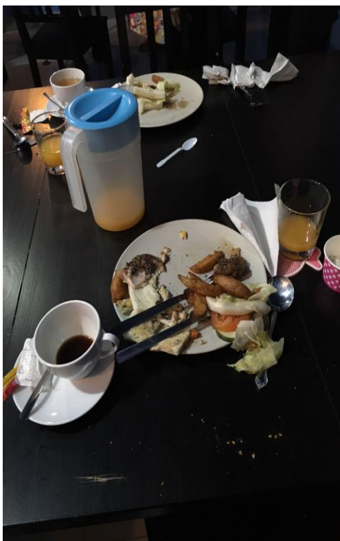
Aftermath of dining in the dark