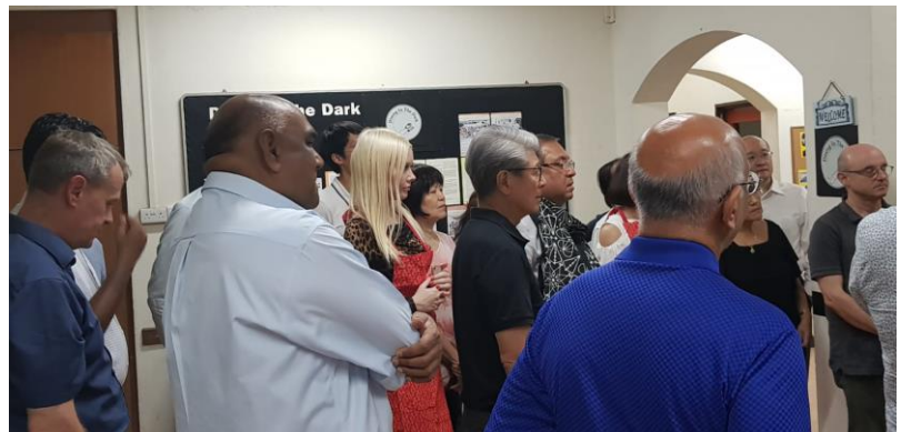
Briefing at SAVH