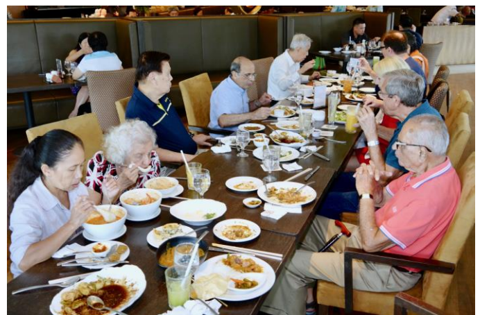
Everyone enjoying a sumptuous lunch