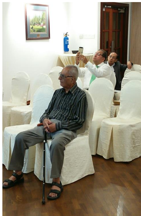
Members and guests paying close attention to the reports