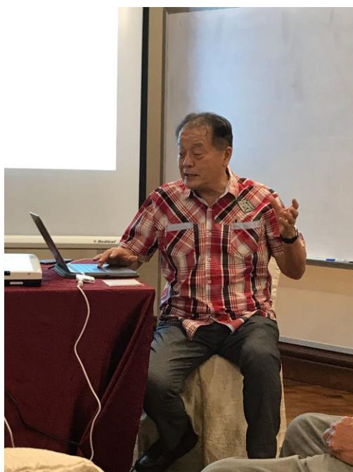
Photo Album of the International Service Committee Meeting held on 19.4.18 at the Singapore Island Country Club...contd.