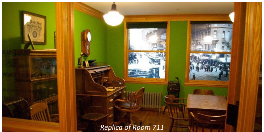
Replica of Room 711