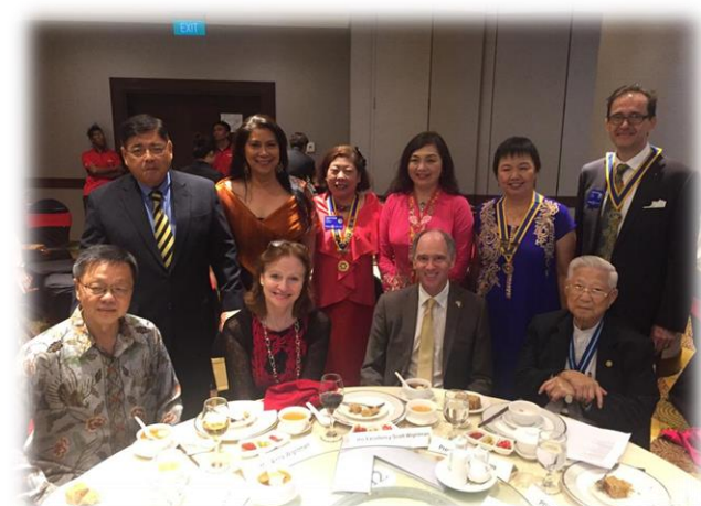
At the VIP Table