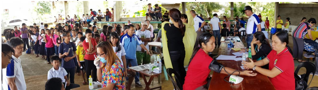
1st Day Dental Mission in Brgy Baculod