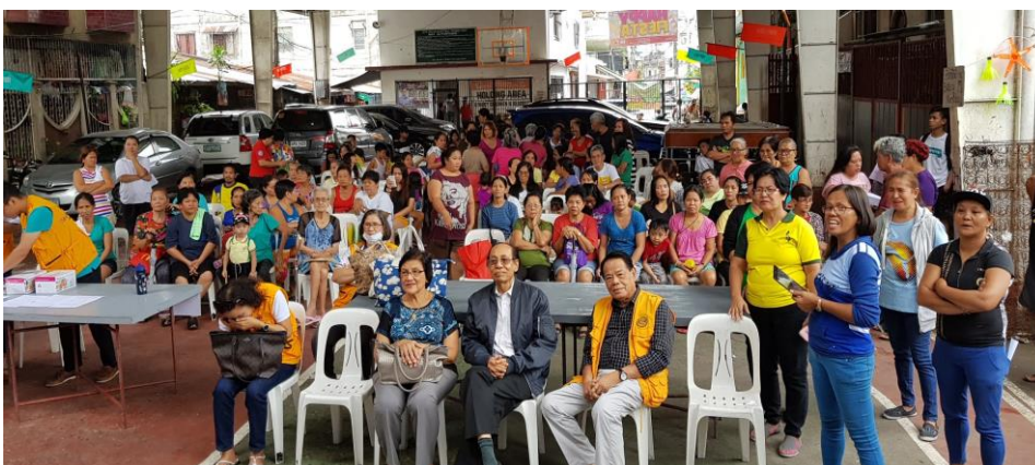
The morning crowd at the Opening Session, Sitio Imelda