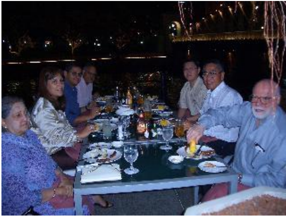
Enjoying fellowship after the VSC meeting on 13.2.04