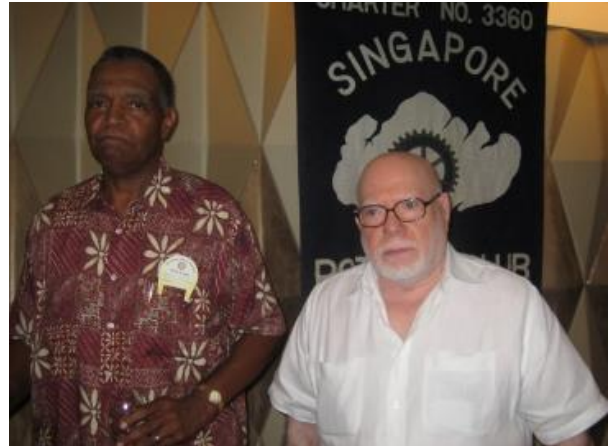
Welcoming a visiting Rotarian to the Club on 23.6.10