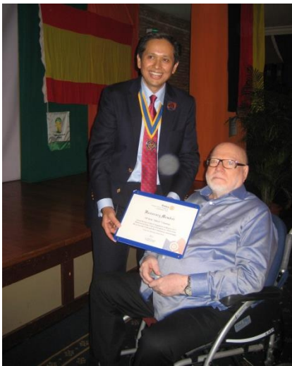
Conferred Honorary Membership on 25.6.14