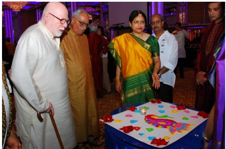
Judging the Rangoli competition at the Club's Diwali dinner on 2.10.09