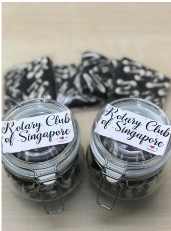
The yummy cookies on sale