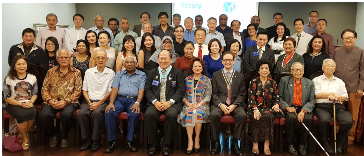
All smiles at the Club Assembly