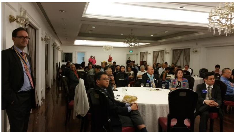
At the Club Assembly held at Senior Police Officers' Mess