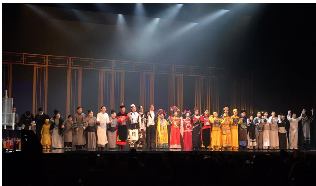
The wonderful cast of the Forbidden City musical taking a bow