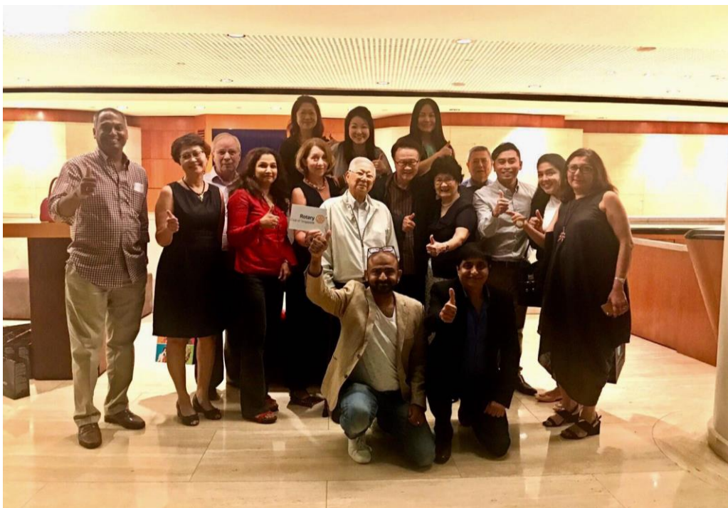
Members with families and friends at the Singapore Esplanade

A big "Thank You" for making this fellowship event a success and I promise more such exciting events coming soon.