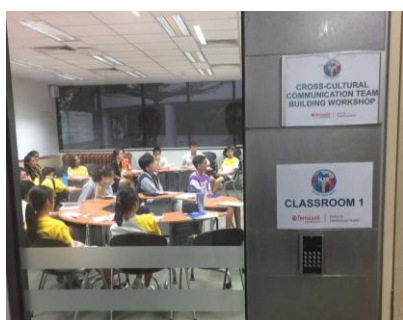
ILTC 2017. Back to the classroom for some serious work