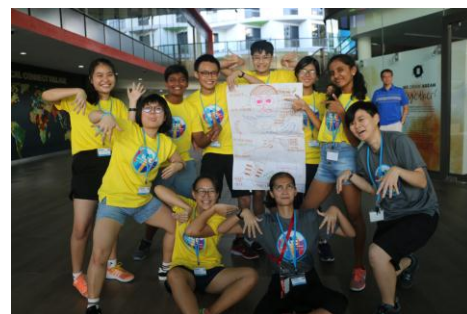
Great fellowship among the participants