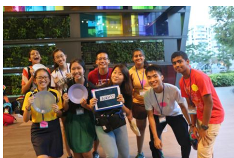
Various camp activities