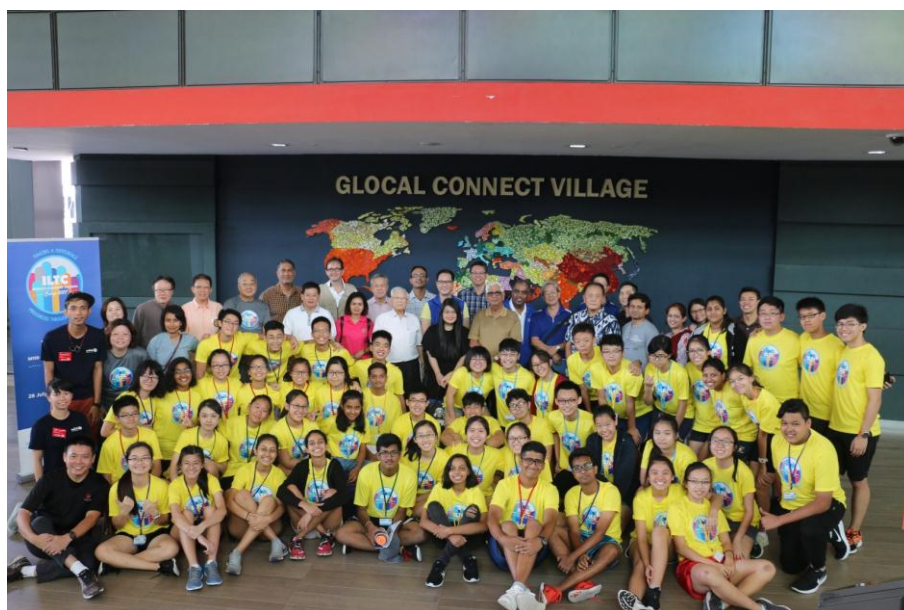
Cheers ILTC 2017!!

On the final day, an election amongst the clubs to form the new board of the Interact Coordinating Committee (ICC) for 2017-18 was carried out. The ICC's mission is to serve as a platform for communication and dissemination of information amongst the Interact clubs. As part of its mission, it will also aim to organize a joint major project for the Interact clubs.