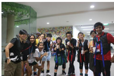
Ageing simulation. Note the ear muffs, weighted jackets, elbow and knee braces