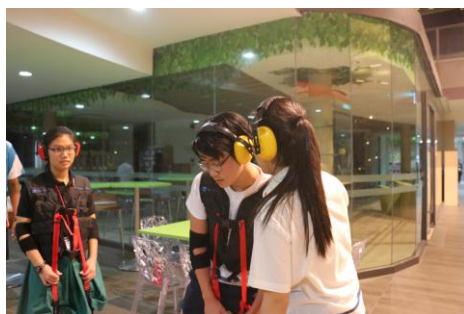
Ageing simulation. Note the ear muffs. Here, the participants are taught how to speak to the elderly who may be hard of hearing